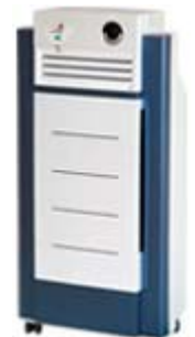
300B OdorVOC EP