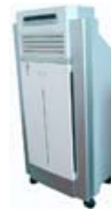
300A OdorVOC EP