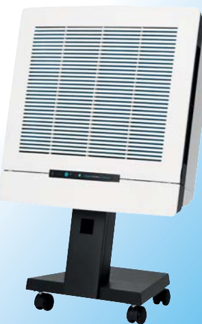
VisionAir Blue Line 1 on display

* Ideal for countries where service contracts for maintenance cannot be concluded.