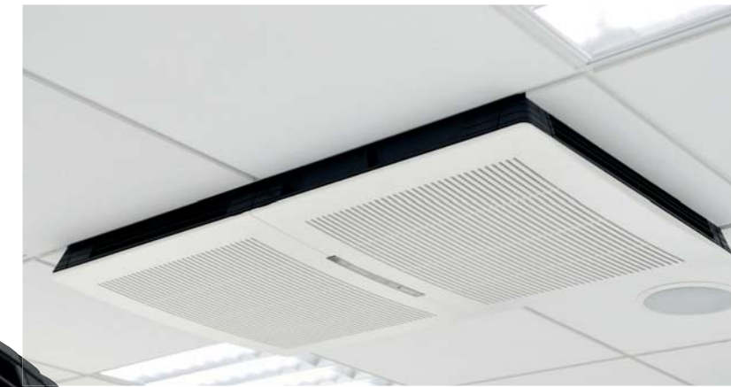
VisionAir Blue Line 2