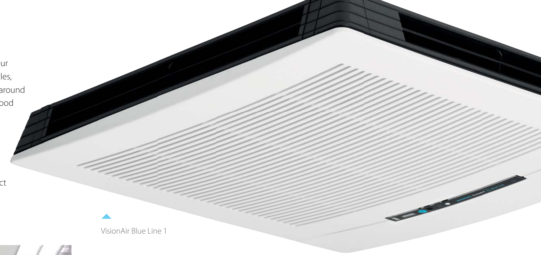
VisionAir Blue Line 1

The VisionAir Blue Line allows you to effectively tackle any problem with your indoor air. Depending on the room and the specific pollutants, the VisionAir Blue Line offers a perfect made-to-measure plug & play solution.